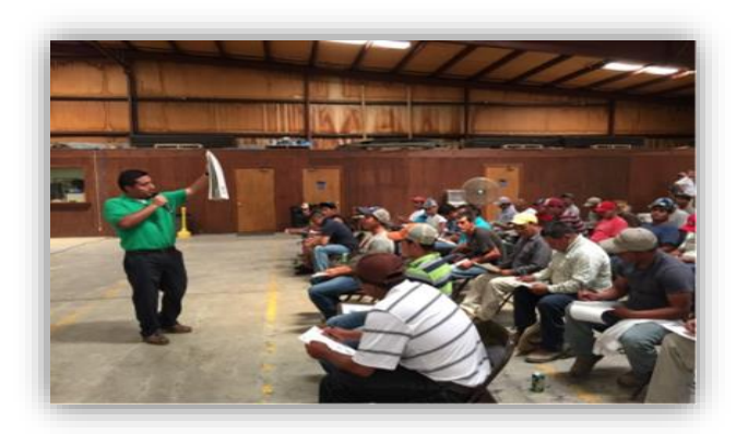
96 % of trained workers understood the key concepts on pesticide, heat stress, and green tobacco sickness safety and prevention.

"My workers are more careful at the farm."